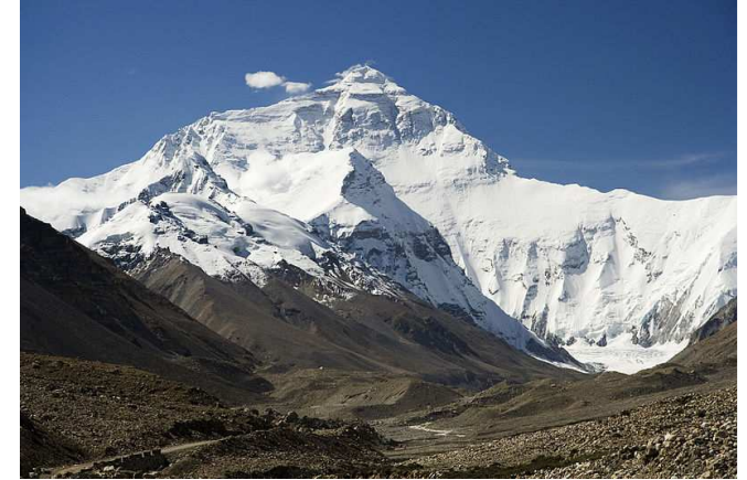
Mount Everest, Nepal (8848m)

Difference between polar and equatorial radius is